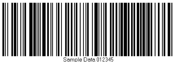
Figure 3: Barcode rendered with valid license.